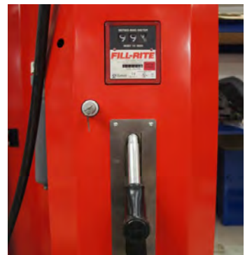
Refuel station with counter

Previously useless water contaminated fuel is transformed into valuable petrol or diesel. An integrated ATEX approved pump and dispensing unit allows the easy transfer of clean filtered fuel to the fuel tanks of your vehicle fleet.