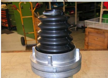
Easy change of drill bit and rubber sleeve