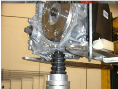
Tested and approved

The SEDA GearboxDrillingMachine is a flexible system that can be used in a variety of settings. The robust device can be mounted either on a mobile base with wheels or on a swing arm with integrated suction hoses. Spare parts are readily available and are easy to assemble. A special set of spare part is included.