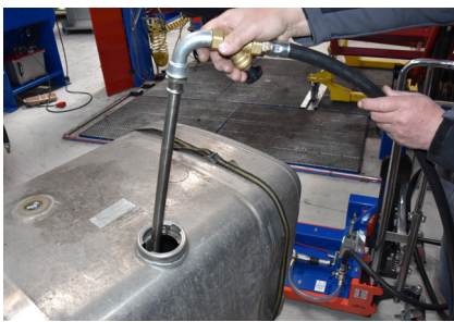
Extraction via the suction lance