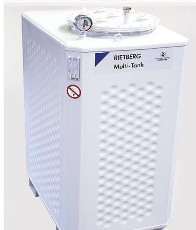
Rietberg MT 900

KA 400 liters upright (Petrol; 1000x1000x900; hot-dipped)