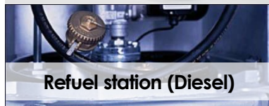
Refuel station (Diesel)