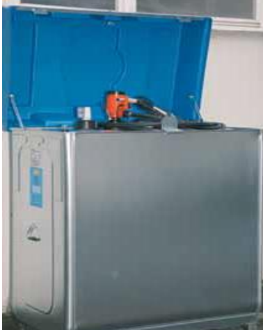
Uni Tank 400 with top