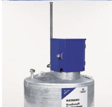
Rietberg KA 400