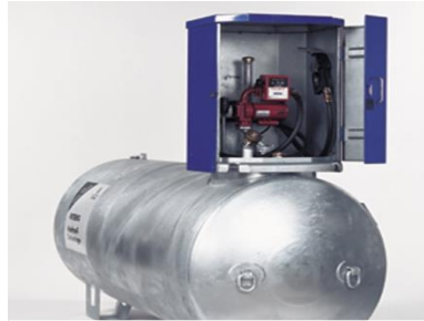
Rietberg KA 2000