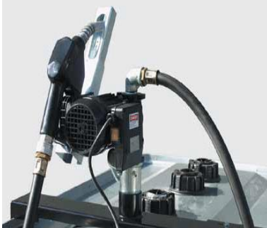
Elect. pump & fuel nozzle