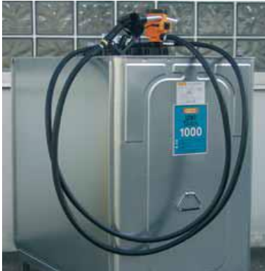
Chemo refuel station UNI Tank 1000